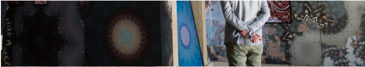
Kurt McVey

After collecting the source material, Spalter uses various custom plug-ins, as well as Photoshop and Adobe After Effects to create the works, often pulling patterns, prints and video segments from one completed piece in order to make an entirely new image or video in an iterative, cyclical hyper-meta narrative using candid human subjects and modern landscape iconography, re-contextualized as equally represented heavenly bodies spinning on their own axis while moving on a larger, alternate axis, very much like our rotating Earth perpetually swirling around the Sun within our Milky Way galaxy, or if you prefer the micro-example, the dizzying “Tea-Cup” ride at Disneyland, a place which Baudrillard once said was the “real America.”